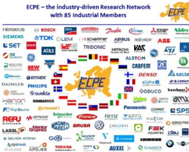
Figure 1: Industrial Members

In the ECPE foundation phase 15 years ago it was a major challenge to emphasize the importance of power electronics. Despite the various power electronics applications already at that time, power electronics had an image problem. Students in electrical engineering found this technology discipline less attractive than telecommunications or nanotechnology. And in research funding programmes, power electronics hardly appeared, the actors had to place their research topics in general programmes of materials or microelectronics research. But driven by the megatrends to increase energy efficiency, the use of renewable energy and then later e-mobility, the importance of power electronics and the corresponding awareness has changed a lot. The topic has moved from the niche to the spotlight.