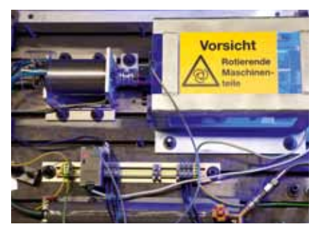
Test bench for a high speed drive